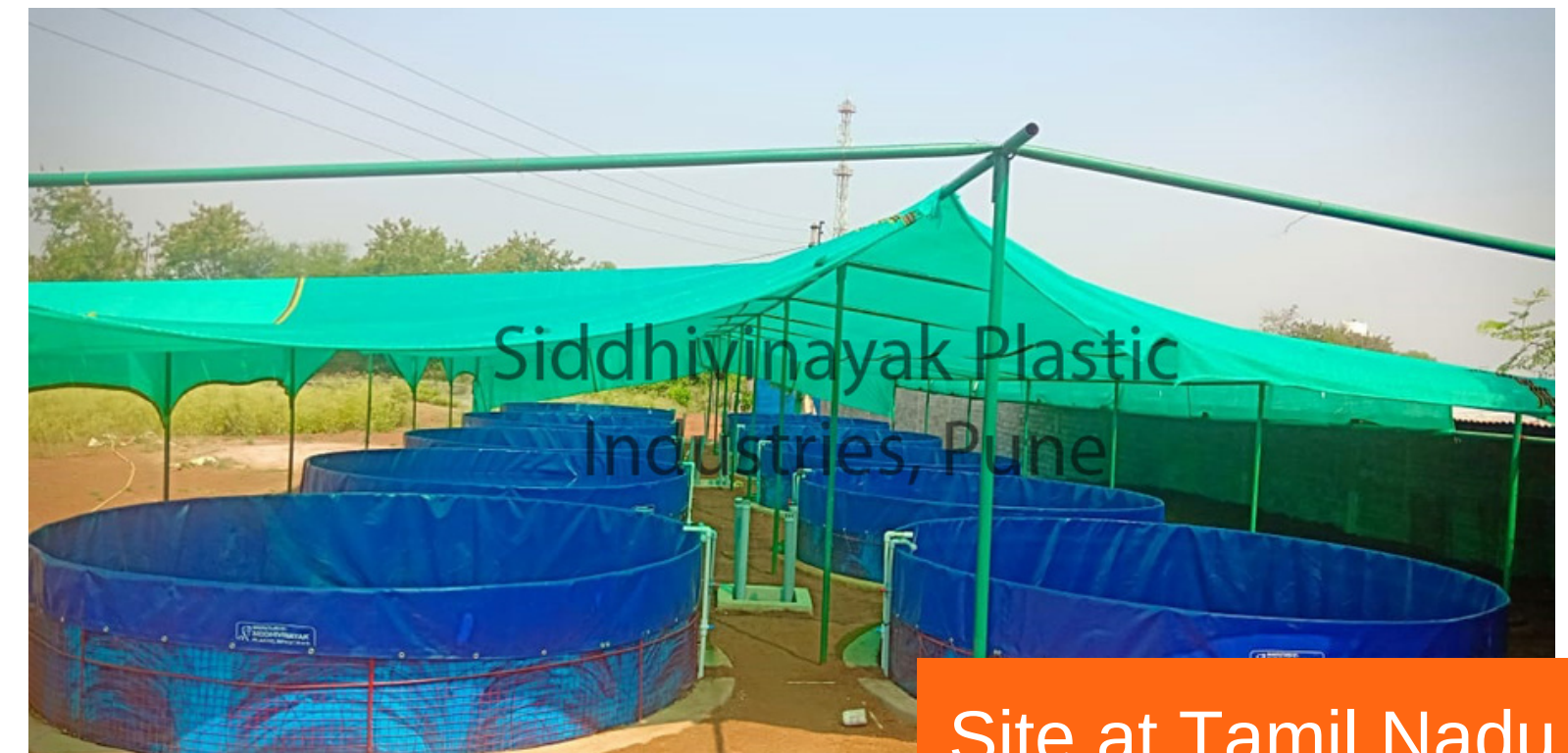
Site at Tamil Nadu