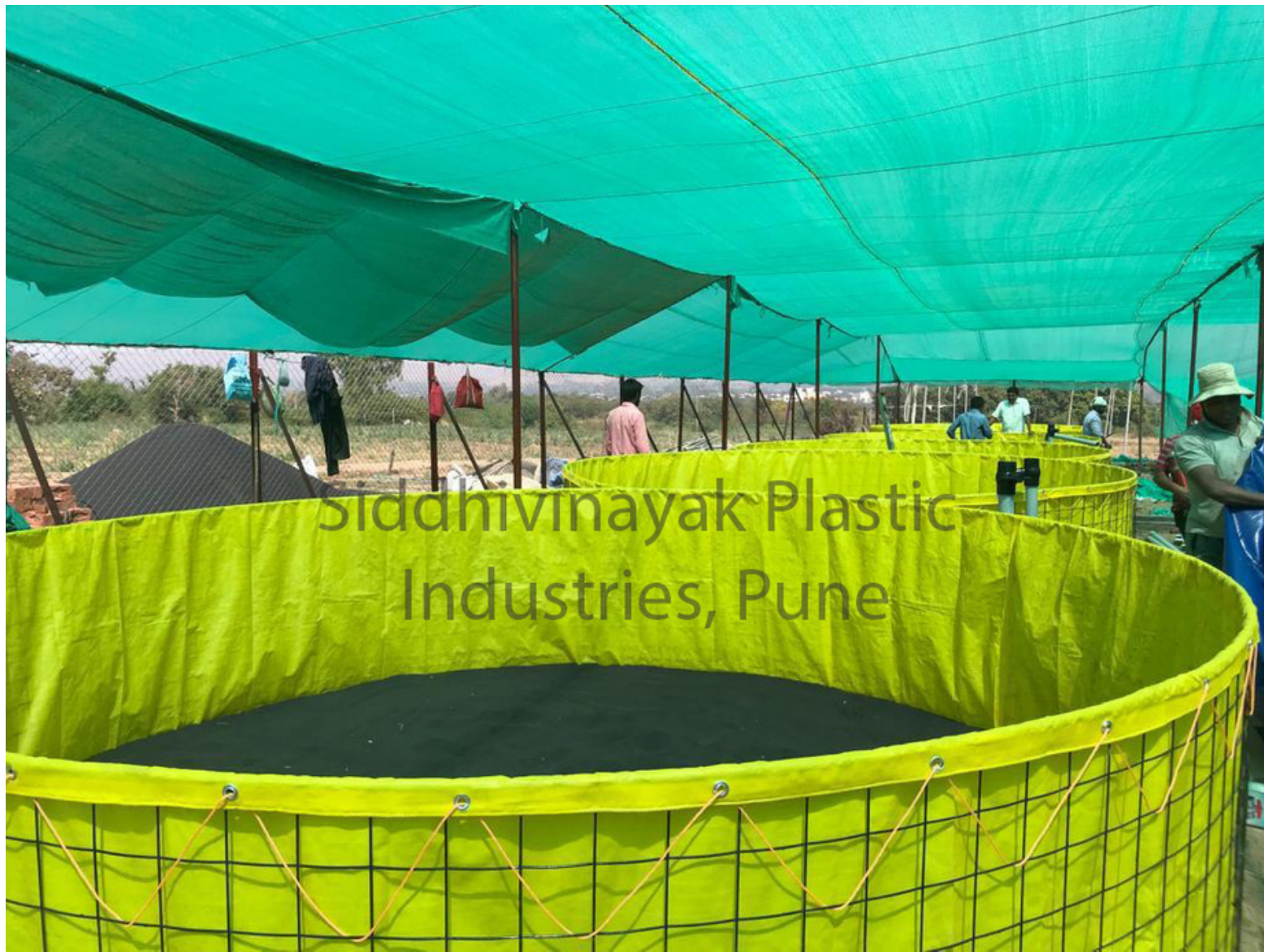
Site at Satara