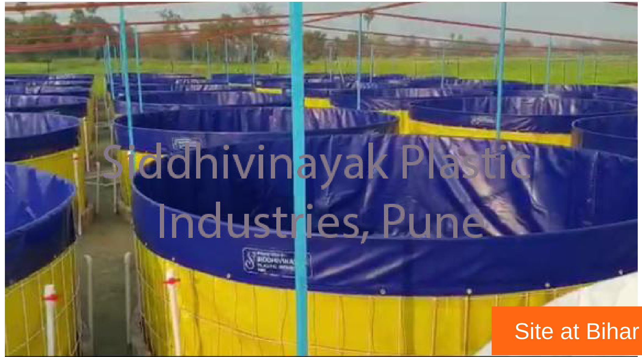
Site at Bihar

Biofloc tank and green shade net are usually purchased together